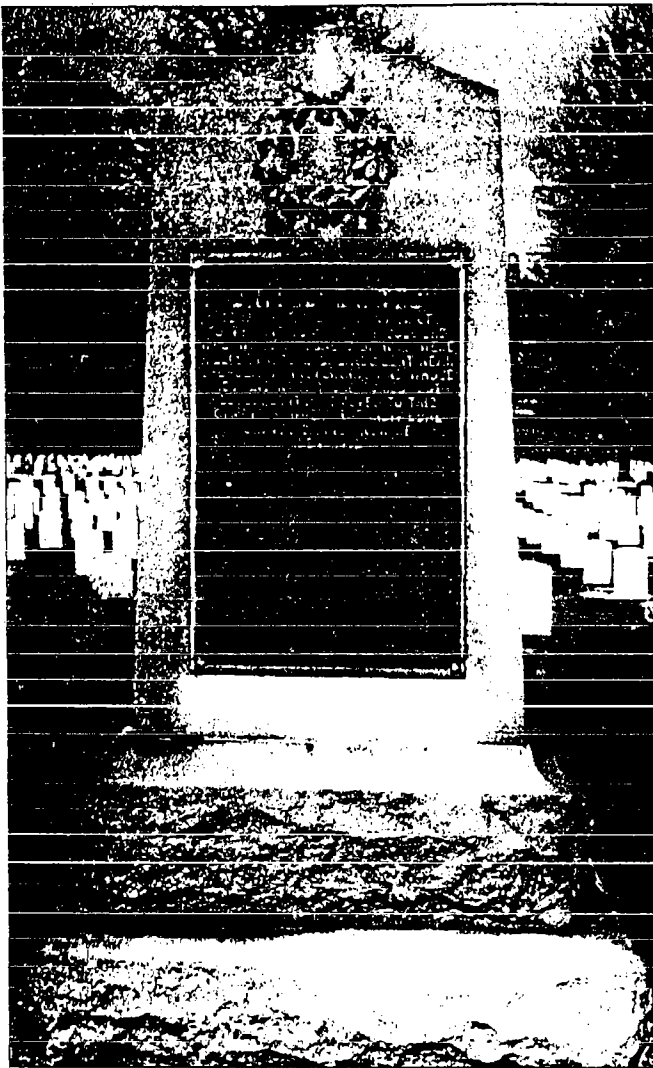
Monument in Woodlawn Cemetery outside Civil War prison at Elmira, New York, marks graves of 49 Confederate prisoners killed in 1864 train wreck near Shohola, Pennsylvania.